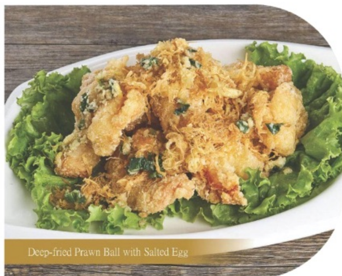
Deep-fried Prawn Ball with Salted Egg