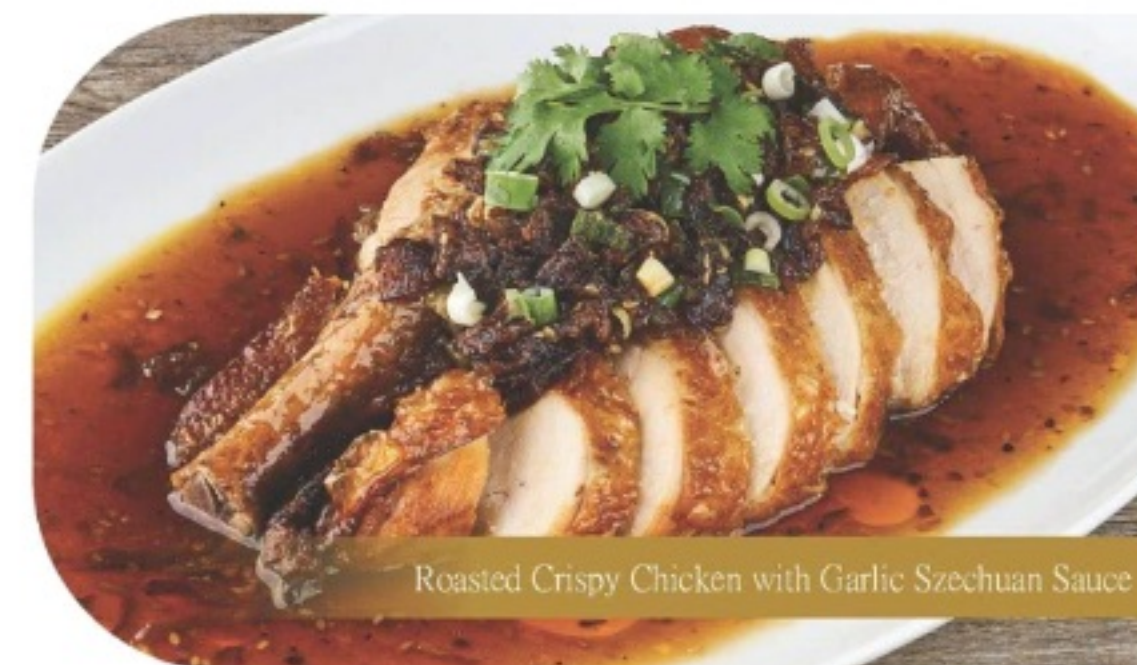
Roasted Crispy Chicken with Garlic Szechuan Sauce

燒鴨絲焗伊面 Braised E-fu Noodles with Shredded Roasted Duck P 690