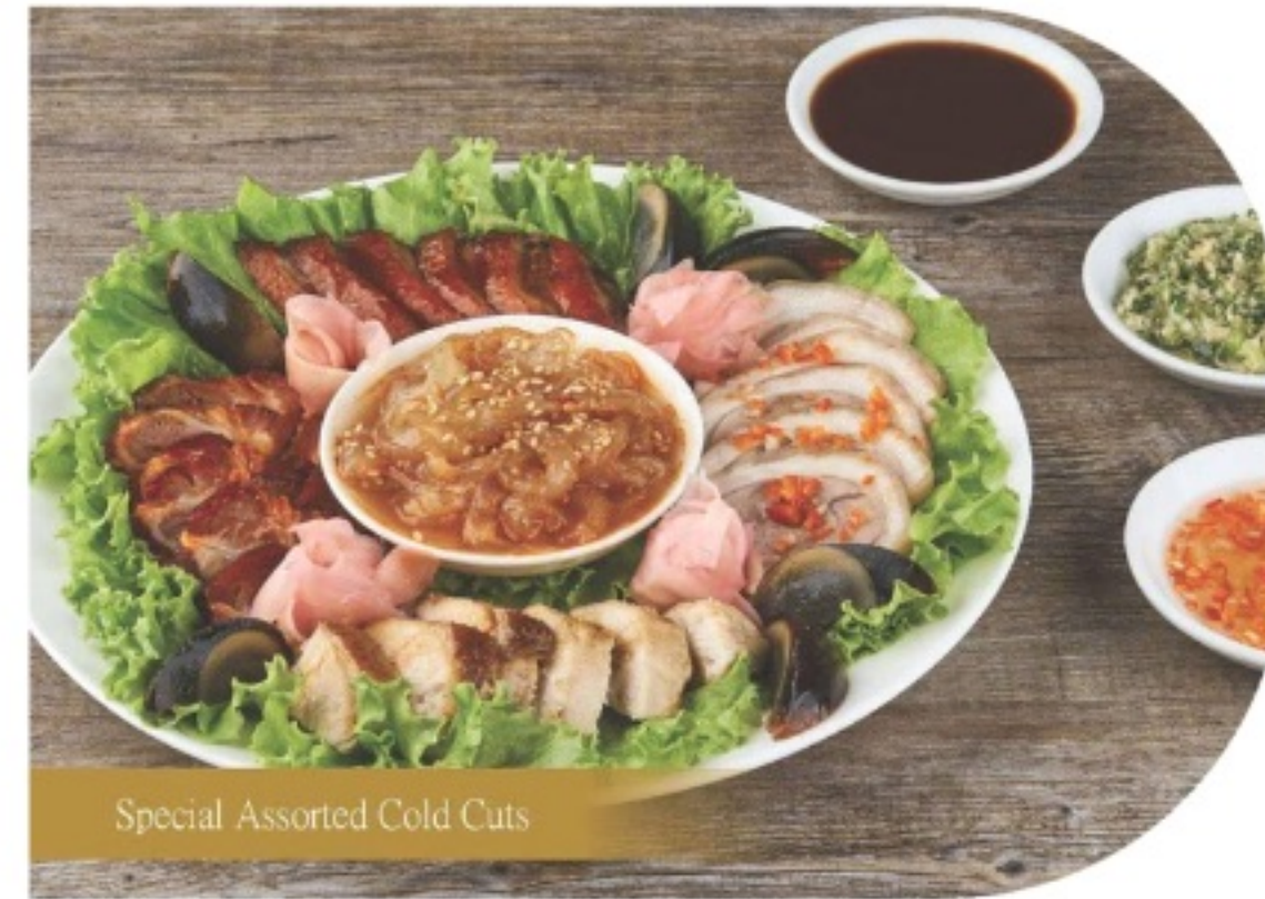
Special Assorted Cold Cuts