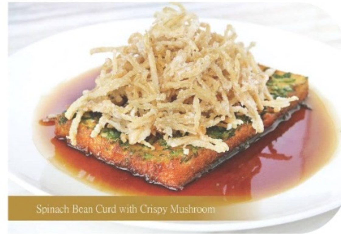
Spinach Bean Curd with Crispy Mushroom