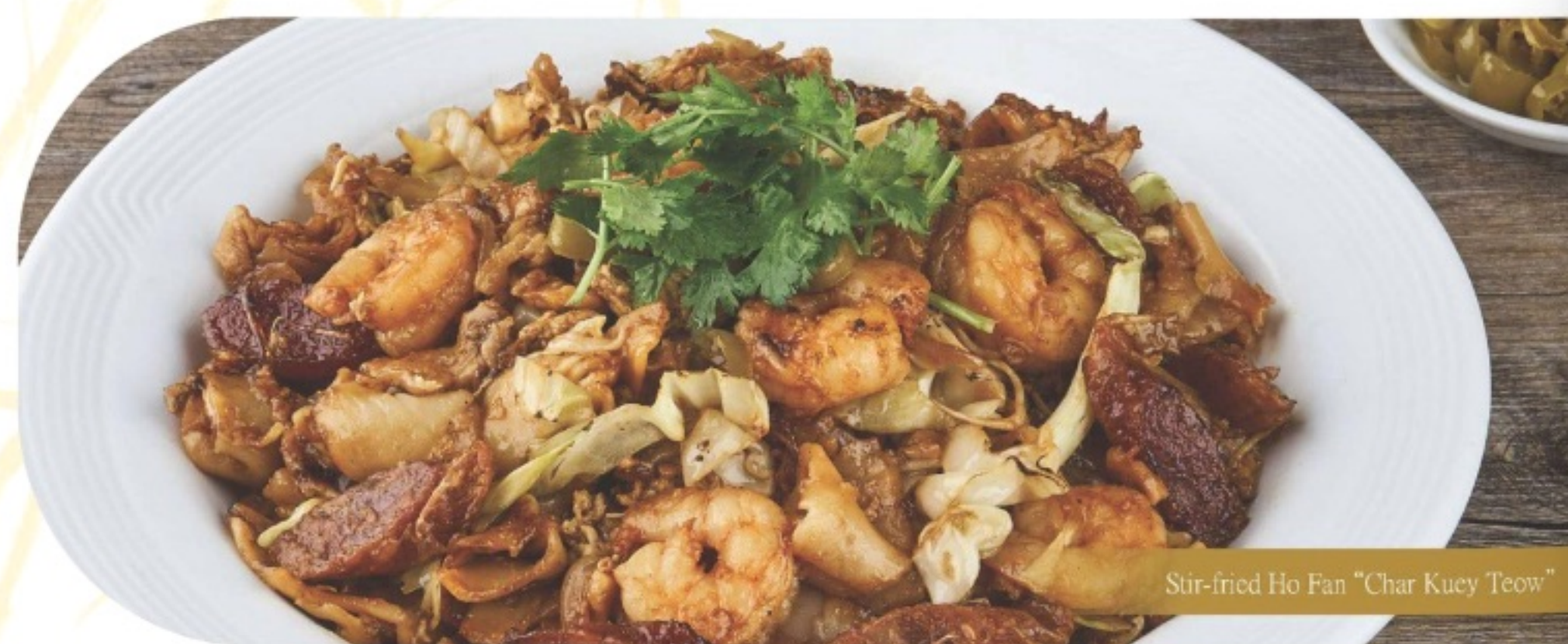
Stir-fried Ho Fan "Char Kuey Teow"

漁香茄子肉碎煲 Braised Minced Pork with Egg Plant in Clay Pot P 560